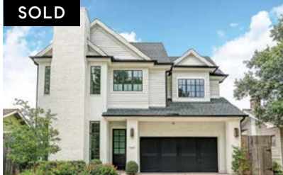
1212 Willard Street