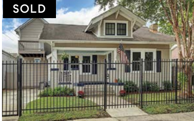
1107 Willard Street