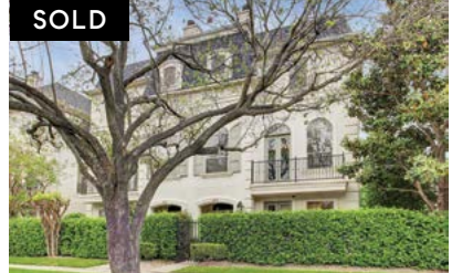
2615 Commonwealth Street