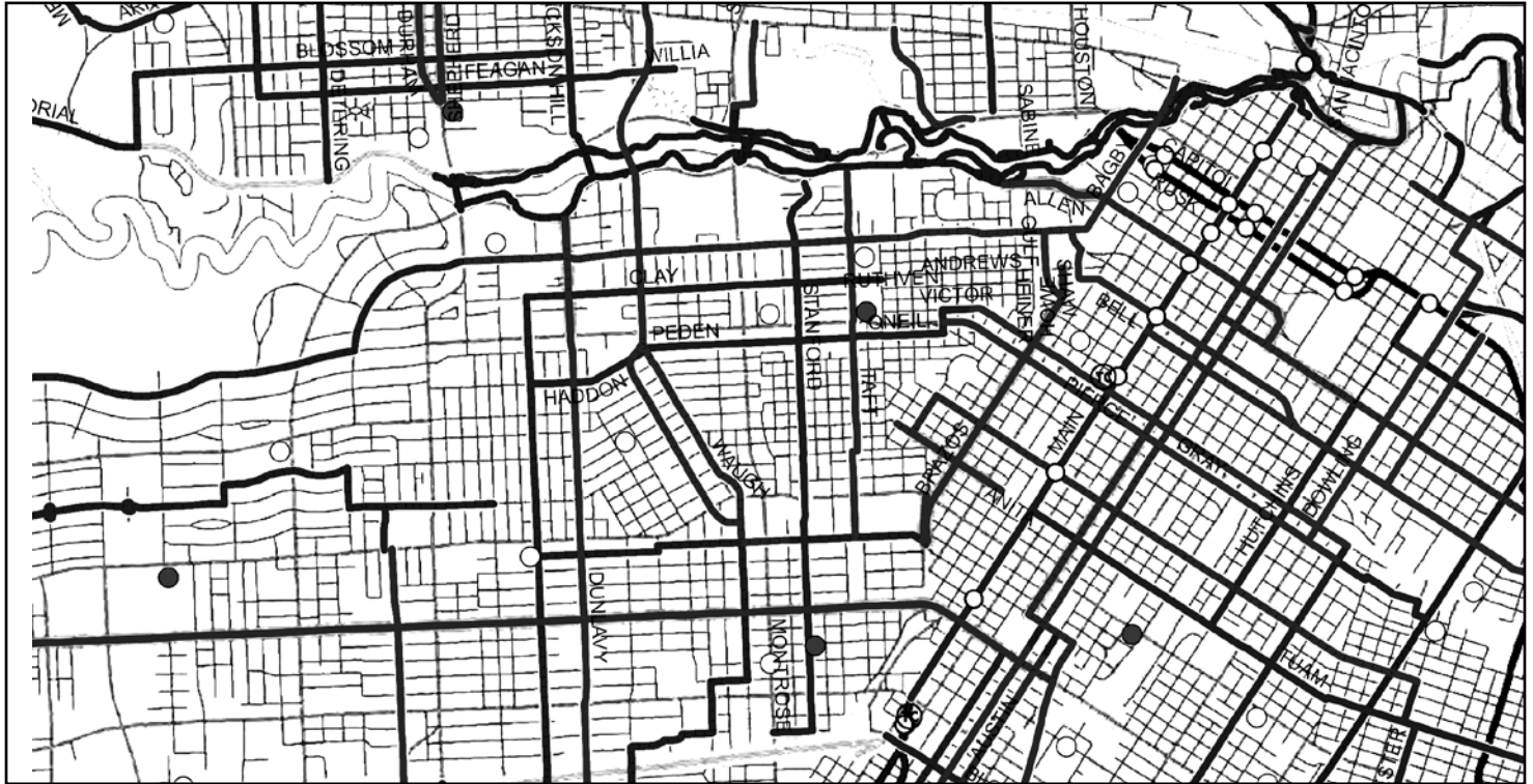
Bikeway proposal map for the next 5 years.

approaches and recommendations for the design of bikeway projects, a policy framework, and programs to educate and encourage more people to bike.