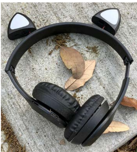
One of the “Most memorable” items discovered during the neighborhood cleanup