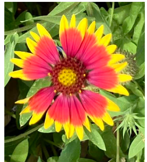
You get to see many beautiful flowers while helping to beautify the neighborhood. Join us for the next cleanup event.

I would like to encourage everyone to help keep our neighborhood tidy, by carrying an extra plastic bag when walking, pick up any trash in your path and dispose of it appropriately. It takes “many hands” to keep our community looking nice. Special thanks to Joe for cleaning Lamar Park daily and tending to the dolphin fountain, skimming it for fallen leaves and maintaining the proper water level.